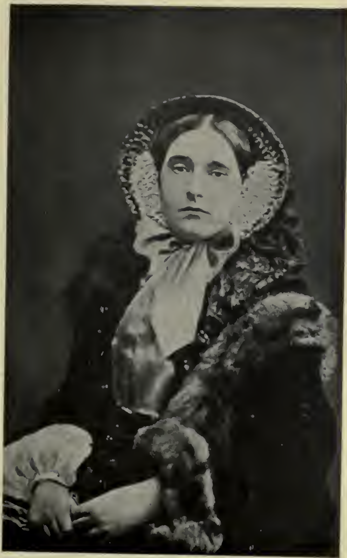
THE PRINCESS MATHILDE BONAPARTE.